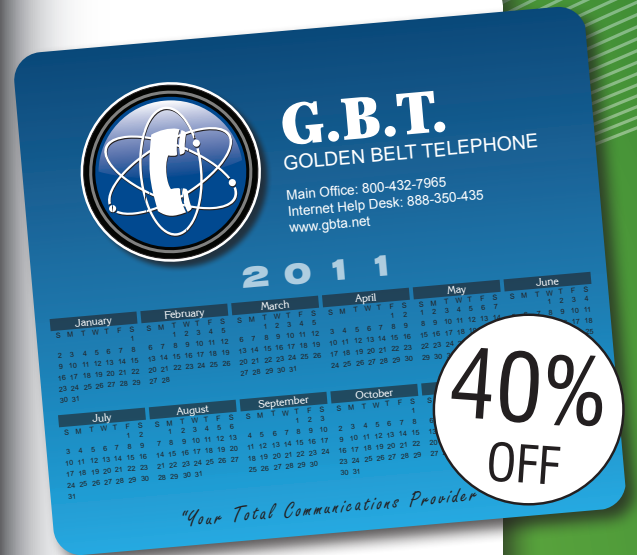
Mouse Pad Calendar

1125 US Hwy 281 Bypass • P.O. 997 • Great Bend, Kansas 67530-0997 (620) 793-6351 • (800) 299-6351 • Fax: (620) 792-5322 GoldenBelt.com